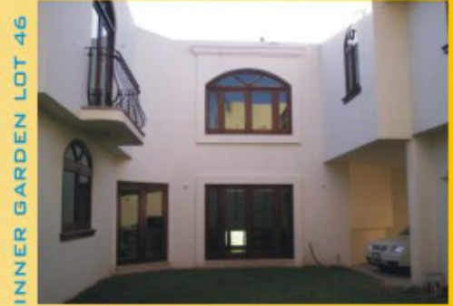
INNER GARDEN LOT 46

Lot 46 Front 58.43 ft Depth 68.73 ft Lot Area 4015 ft2 Livable Area 4040 ft2