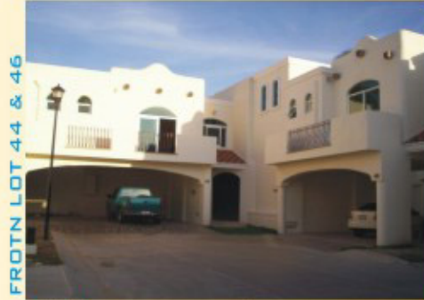
FRONT LOT 44 & 46